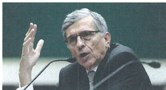
FCC Chairman Tom Wheeler

Naturally, such crucial advisement falls on stone deaf ears at the FCC, currently headed by the Wi-industry's most infamous lobbyist and cover-up specialist, Tom Wheeler. [40] Chairman Wheeler, seen below, is former head of CTIA, the Wi-industry's leading global trade organization. Wheeler's shoo-in appointment as the US Wi-radiation czar demonstrates how successfully the Wi-Mafia, with its extraordinary money and power, ensures that Wi-regulators and Wi-regulatees remain as one big, happy, microwave-enriched family. WHEELER'S HISTORY HERE